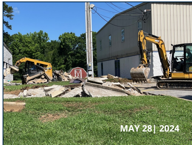
MAY 28 | 2024