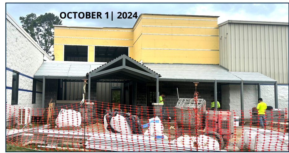
OCTOBER 1 | 2024