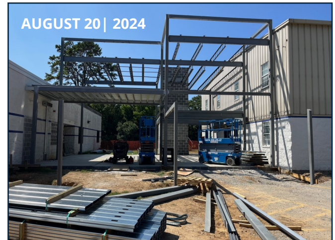
AUGUST 20 | 2024